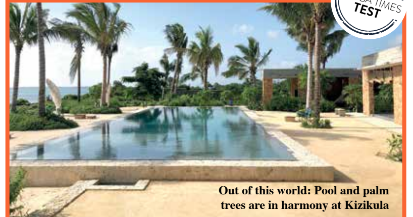
Out of this world: Pool and palm trees are in harmony at Kizikula