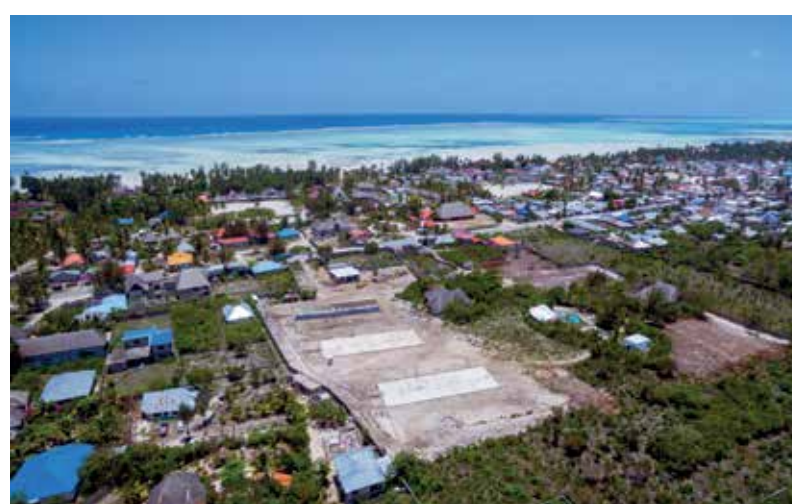
Enjoying a private afternoon (upper photo) in your own holiday home. The Soul's construction site in walking distance from Paje beach (below)