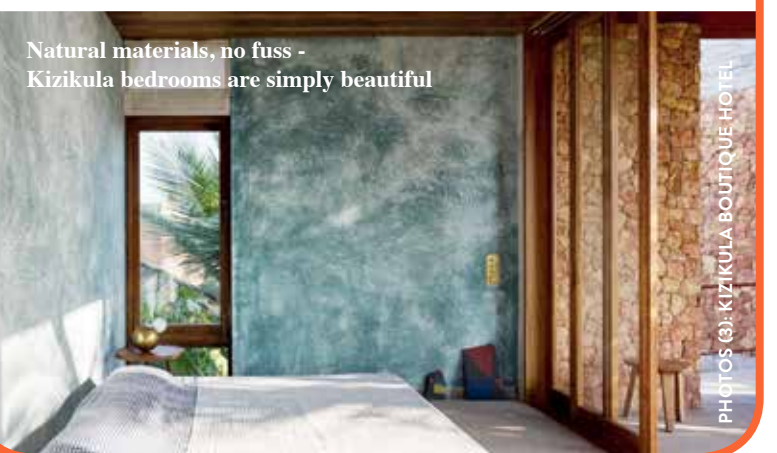
Natural materials, no fuss - Kizikula bedrooms are simply beautiful

Kizikula Boutique Hotel Kizimkazi, Zanzibar Tanzania+255 687063393 info@kizikula.com kizikula.com