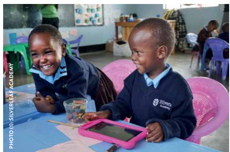
Happy to learn and evolve, kids deserve the best education possible

Silverleaf and Montessori starting beginning of 2021