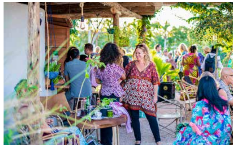
After-work Fridays: "Kwetu Kwenu" kiosk is the social centre of Fumba

Meanwhile, not only new residents enjoy the Fumba bliss. When Jane Goodall came to Fumba Town recently for an open-air lecture (see story below), people from everywhere in Zanzibar came to meet and greet the world-famous chimpanzee researcher.