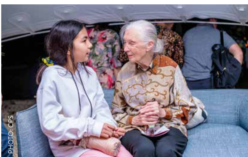
Jane Goodall taking time to talk to youngsters in Fumba: New generation Zanzibari read every word from the famous researcher's lips

Chimpanzee heroine comes to Zanzibar for an evening with the Fumba community