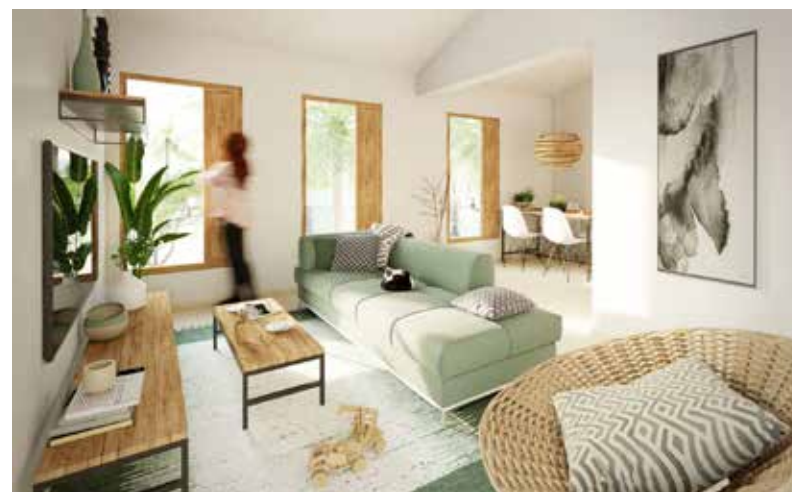
Modern living in Fumba: interior of upcoming apartments now on sale