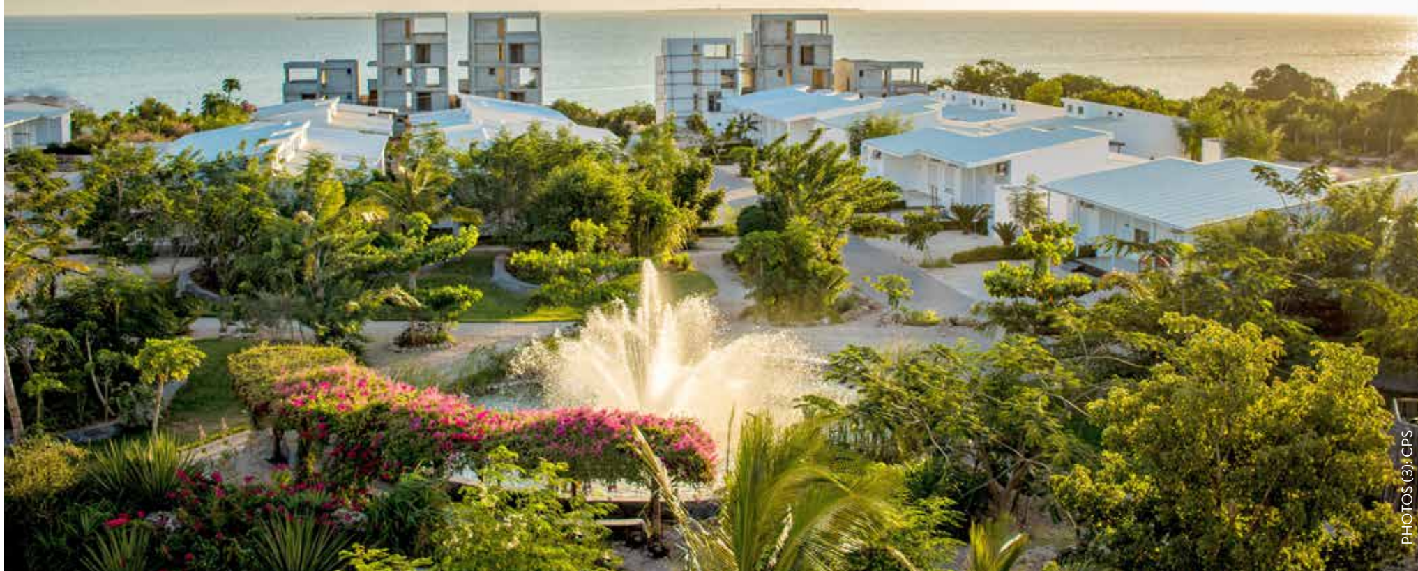
Fumba Town in Zanzibar, only 20 minutes away from Stone Town: Like a green oasis the eco community along the sea front of the Fumba peninsula is becoming reality

Famous visitors, first residents and after-work Fridays - it's all happening in Zanzibar's Fumba Town