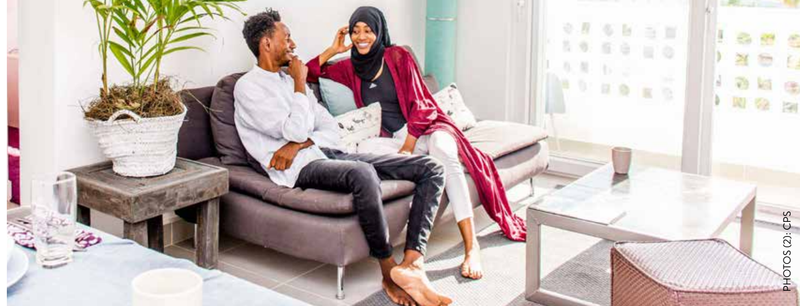
Starting your new life: Monthly rent rates in Fumba begin at around 300 US dollars for apartments and houses with services like security included

How property is rented and let in Fumba Town