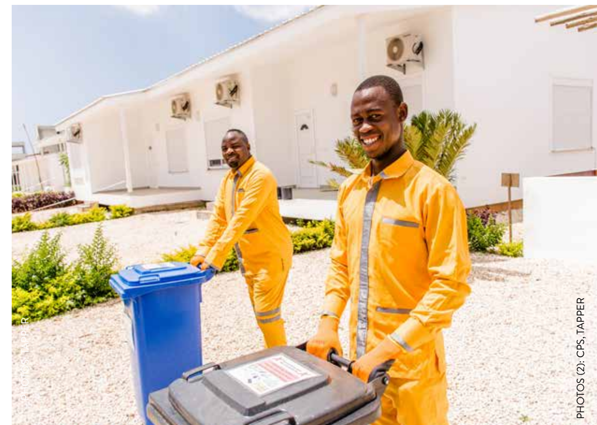
Waste collectors in Fumba taking the stigma out of trash with bright yellow uniforms - and a smile

Although people of Zanzibar can watch the hardworking municipal street cleaners and dump collectors in neighbourhoods of Stone Town every day, there remains a huge amount of uncollected waste. In 2014, a scientific study done by a Malaysian NGO revealed that not even half of the garbage dumped anywhere on the island gets collected. "Open dumping is the prevalent method for final disposal", concluded Biubwa Ailly, the researcher from Malaysia. "Trash blocks the drains and poisons the water" was the blunt verdict of a