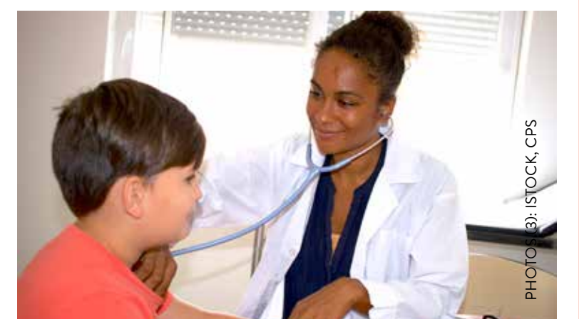
WRITE TO US!

However, the real problem we are facing in many houses in Zanzibar are not ACs or fans but poor indoor air quality. Polluted indoor air due to insufficient ventilation and harmful building materials poses a risk to respiratory health. Adequate ventilation, regular inspection and house