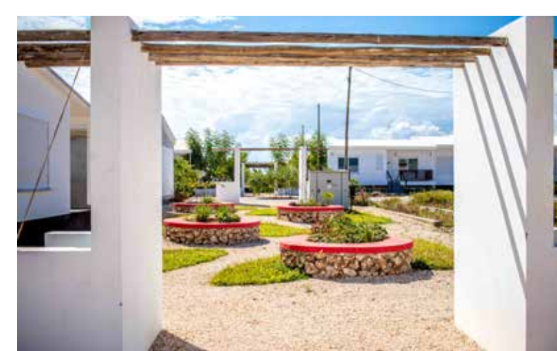
In "green rooms" between houses and apartments the household garbage gets collected almost invisibly

"Our system is actually more advanced than in most Western cities", says Goehse. If a house owner is unsure just what to do with a broken bulb or his old tires, he or she can call the Town