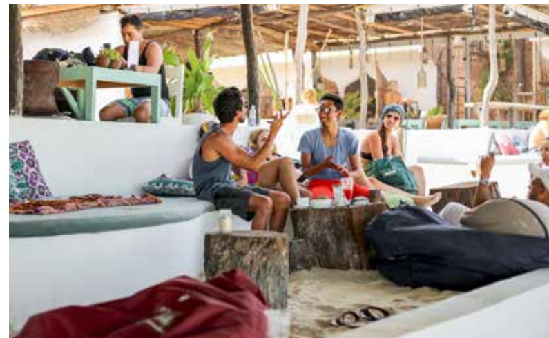
The wow-effect of Paje: Turquoise waters perfect for swimming, sunbathing and kitesurfing. The pool of popular B4 beach club (left) is an eldorado for fans of electronic music. The club offers bungalows, burger and sushi. Mr. Kahawa (right) is a fashionable beach meeting point for health food fans

activities, from sushi on the packed beach to movie nights, and popular Saturday nights with electronic music.